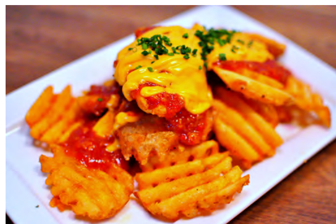
Chilli Crab Waffle Cheese Fries